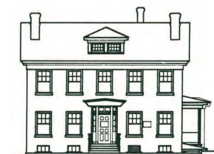
FOURTH BUILD 1939 - 1986