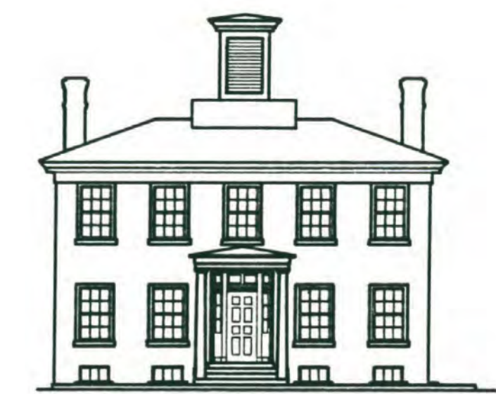
FIRST BUILD 1851