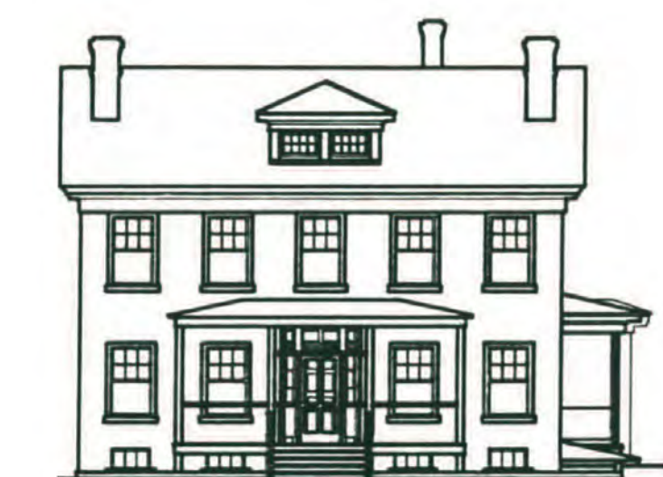
THIRD BUILD 1923